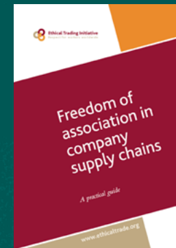
ETI's suggested action plan