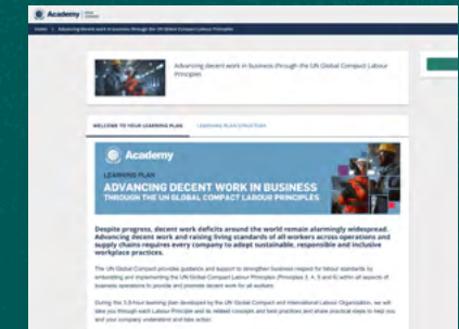
UNGC Academy's Module on Freedom of Association